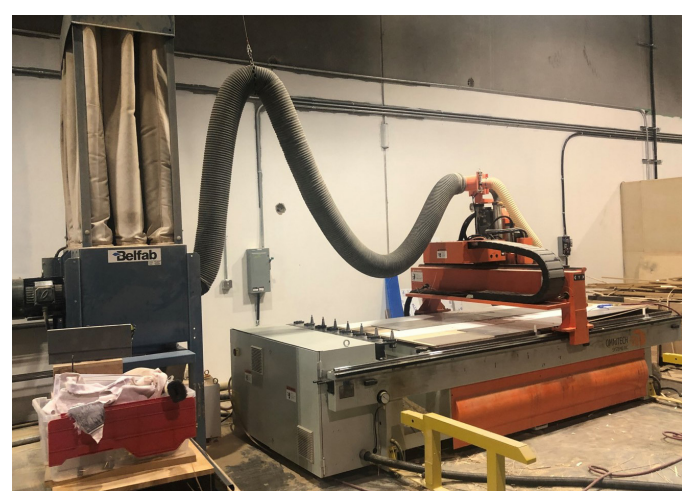
Left: NVMA staff beside Streetcar #153, which once carried passengers up and down Lonsdale Ave and will delight visitors in the entrance lobby of the new Museum when it opens this fall. Our programming team is currently developing interpretation to bring the streetcar to life.

Below: the CNC (computerized numerical control) machine is a programmable tool that allows the skilled craftspeople at 3DS to cut a wide variety of materials for the making of our exhibits. These cuts can be made to tolerances of a few thousandths of an inch.